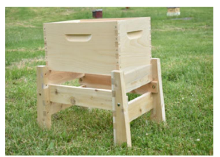
Completed stand pictured with hive box

Step 3: Thread the bolts through the pre-drilled holes on outside of leg assemblies and the side rails (See fig. 3). Slide on the washer and nut on the other side and tighten with a socket wrench. Repeat on all four corners.